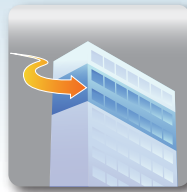
FLOOR / DEPARTMENTS

now you can stop your profits draining away